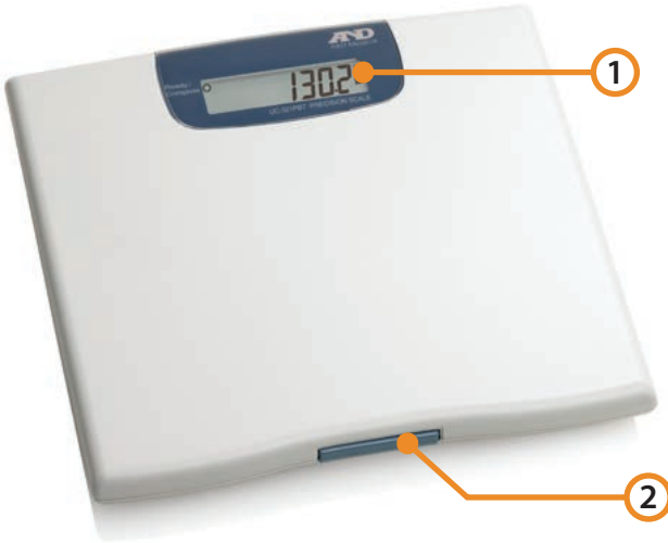
1 - Display 2 - Measurement Switch